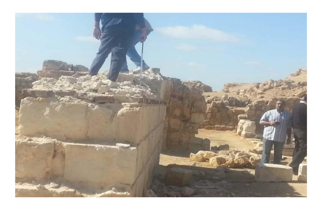
Fig. 6 The removal of the inappropriate construction

The inappropriate reconstruction using new blocks are totally removed and the new restoration using the original blocks of the wall starts.