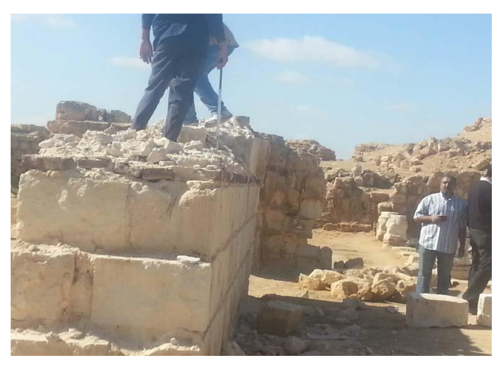
Fig. 9 The removal of the inappropriate construction