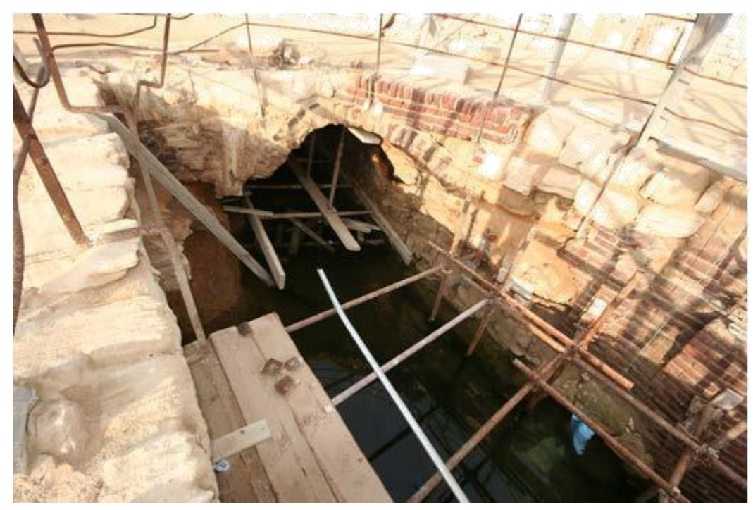
Fig. 4 A view of the tomb of St. Mennas show the groundwater covering almost the lower part of the tomb