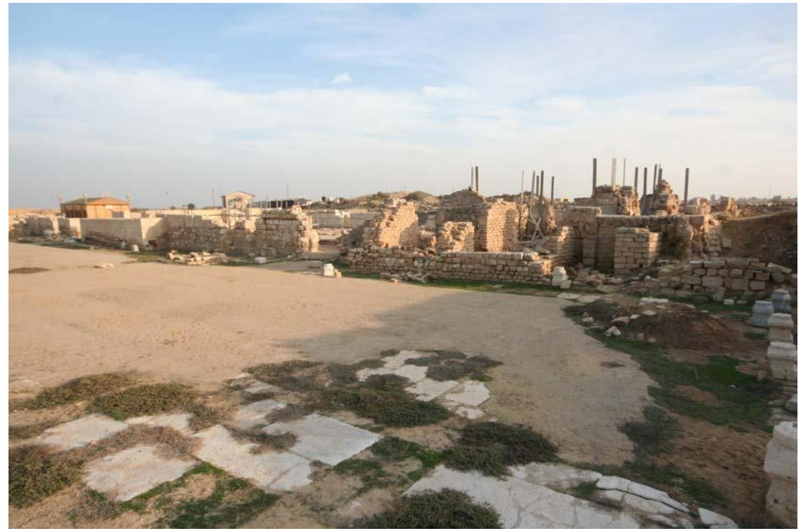
Fig. 1 A view of Abu Mena Site

shops that sells souvenirs to the visitors of the city. In addition, the remains of some flasks, lamps, and toys were found.