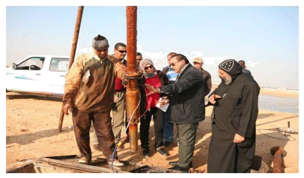
Fig. 5 Removing of the water pumps.