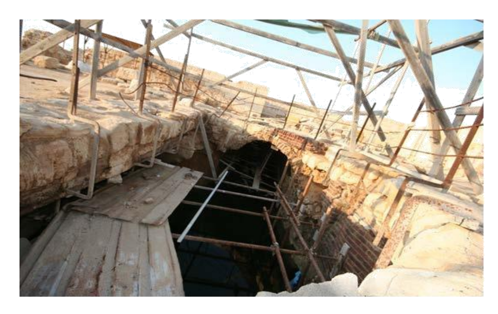
Fig. 2 A view of the tomb of St. Mennas show the groundwater covering almost the lower part of the tomb