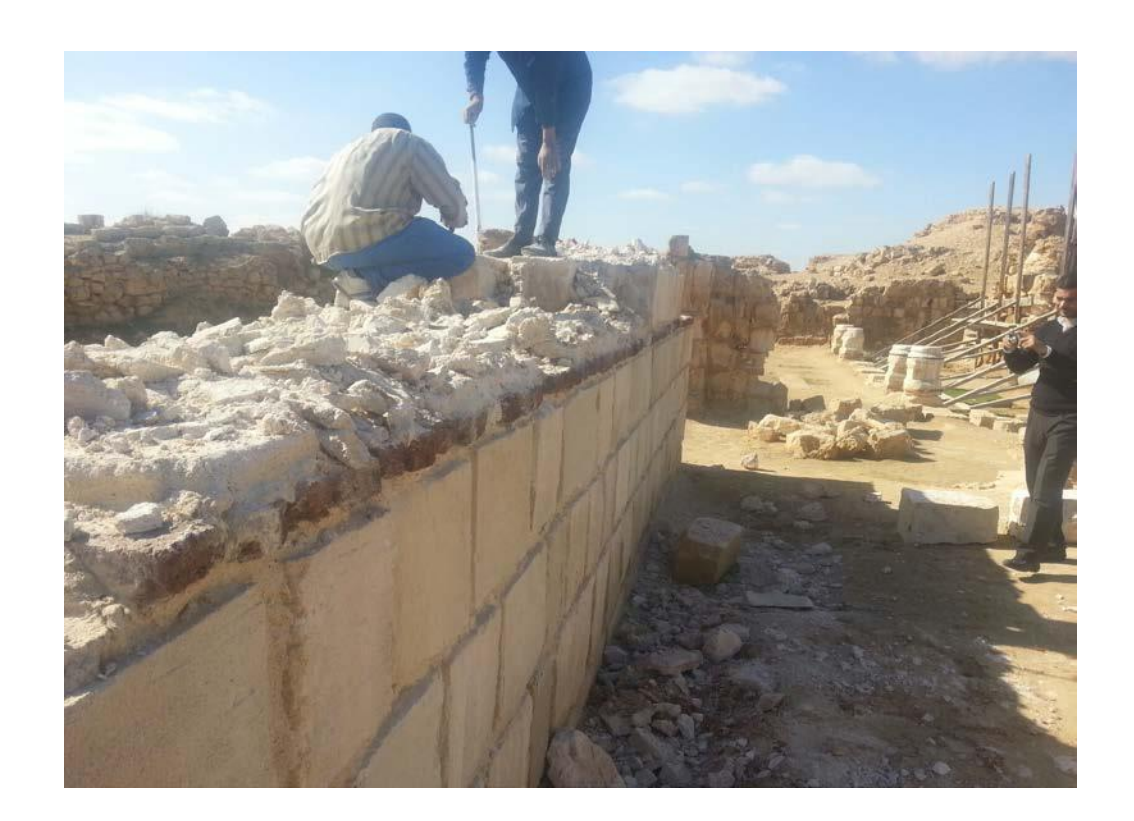
Fig. 8 The removal of the inappropriate construction