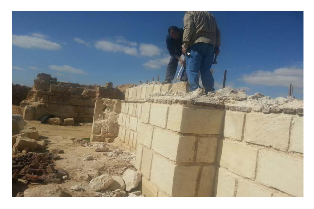
Fig. 7 The removal of the inappropriate construction