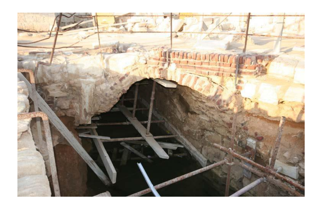
Fig. 3 A view of the tomb of St. Mennas show the groundwater covering almost the lower part of the tomb